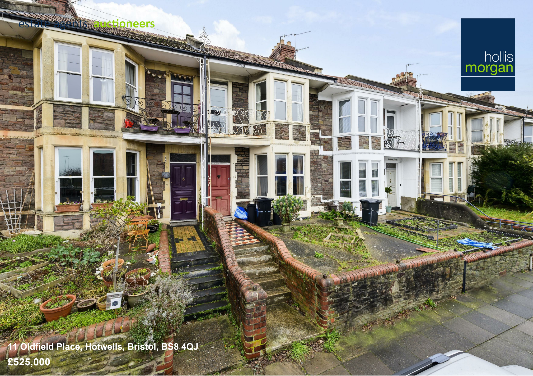
11 Oldfield Place, Hotwells, Bristol, BS8 4QJ £525,000